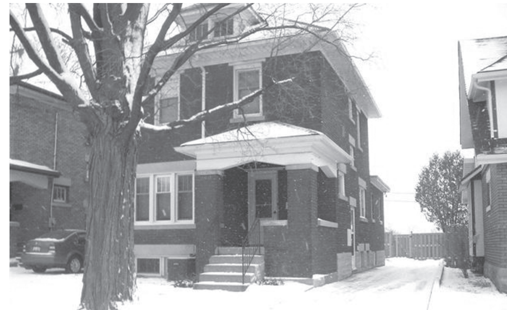
Our Somalia Refugee Family Home.

On December 31, 2005 a family of seven from Somalia moved into the house. On January 9 all 6 children (ages 5 to 12) were enrolled at Shepherd Public School.