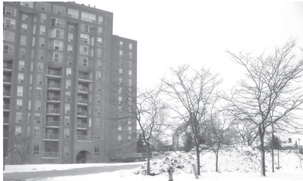
Site for Future Seniors Affordable Housing Apartment Project

Each unit will cost $116,000 on average to build. To meet its cash contribution requirements (see chart above), MennoHomes will need to raise $11,500 @ unit. Any amount you can donate will be greatly appreciated.