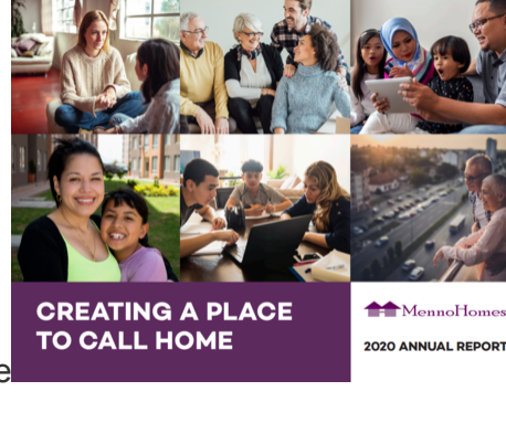
Annual General Meeting - January 27, 2021

MennoHomes held its Annual General Meeting virtually on January 27th. We had a very successful meeting with 87 people joining us by Zoom. Even though we couldn't meet in person it was great to "see" so many familiar faces and we were pleased to have welcomed some new ones for the first time.